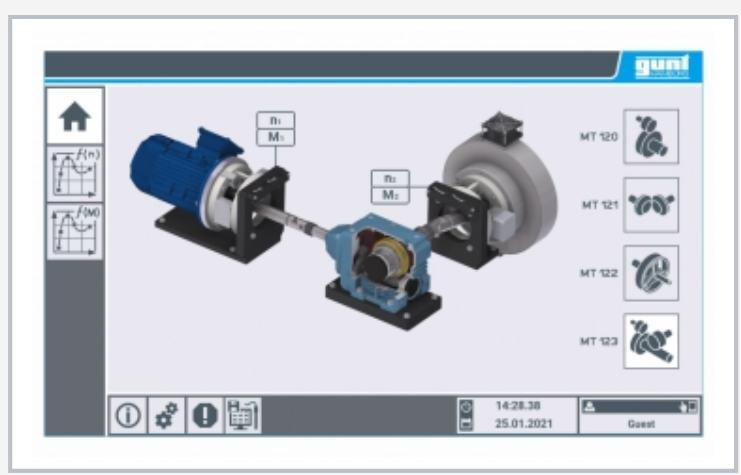
Touch screen: welcome screen