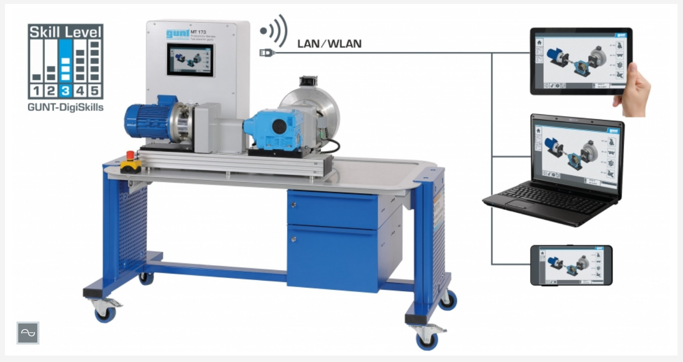
The illustration shows MT 173 together with MT 123 Spur and worm gear, screen mirroring is possible on different end devices